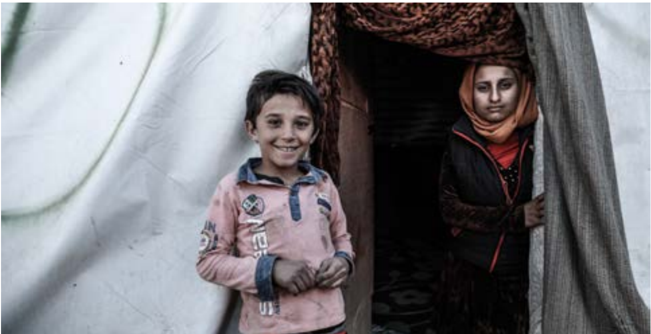
Mother and her boy in an ITS in Zahle, Lebanon. January 2017.

The adoption of the EU-Lebanon Compact, which foresees an EU allocation of at least €400million in 2016-17, in addition to bilateral assistance of more than €80million, was announced on 15 November 2016. In addition to financial commitments, the EU has also committed to increase support to private sector development in Lebanon, provide assistance to help Lebanese businesses take advantage of existing market access to the EU, and seek to reduce existing non-tariff barriers to goods and services.