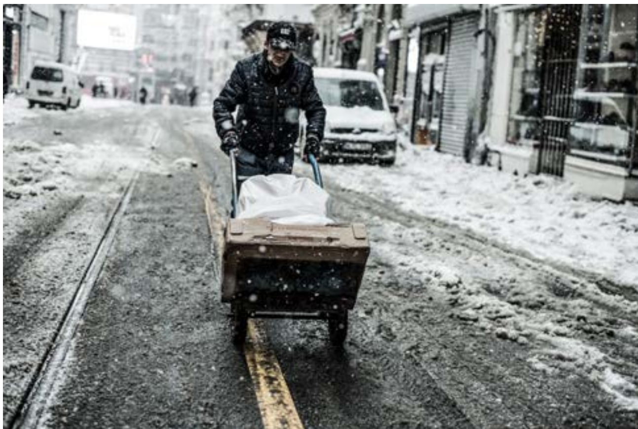
Syrian refugee working in Istanbul, Turkey. January 2017.

In comparison to the funds pledged and or committed to Turkey at the London Conference and through the EU-initiated Facility for Refugees in Turkey, Turkey has spent approximately $25bn of its own fiscal resources on the refugee response. 42