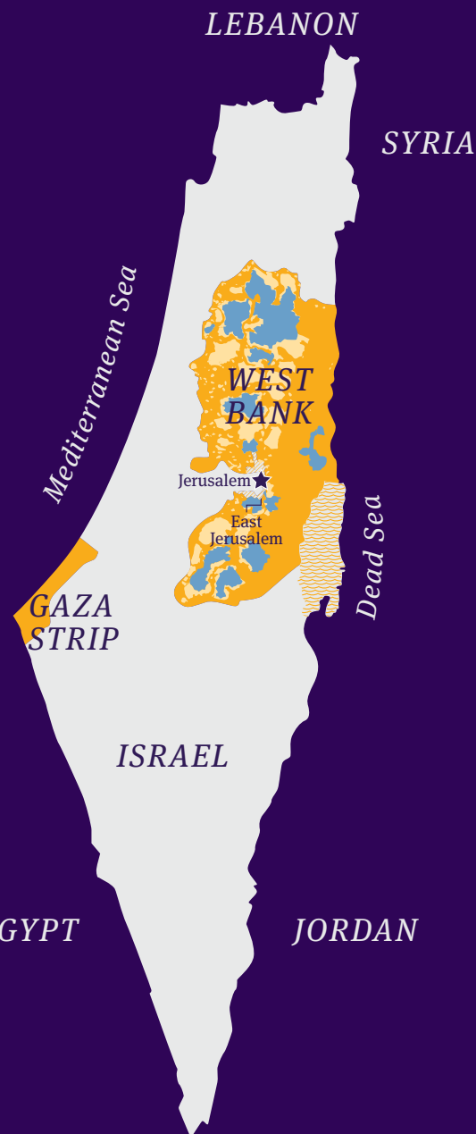
MAP BASED ON: https://www.ochaopt.org/content/west-bank-access-restrictions-october-2017

16,085 Israeli demolition orders against Palestinian structures, 1988–2016 12 3,300+ carried out, the vast majority since 1993