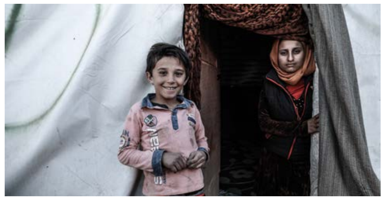
Mother and her boy in an ITS in Zahle, Lebanon. January 2017.

The adoption of the EU-Lebanon Compact, which foresees an EU allocation of at least €400million in 2016-17, in addition to bilateral assistance of more than €80million, was announced on 15 November 2016. In addition to financial commitments, the EU has also committed to increase support to private sector development in Lebanon, provide assistance to help Lebanese businesses take advantage of existing market access to the EU, and seek to reduce existing non-tariff barriers to goods and services.