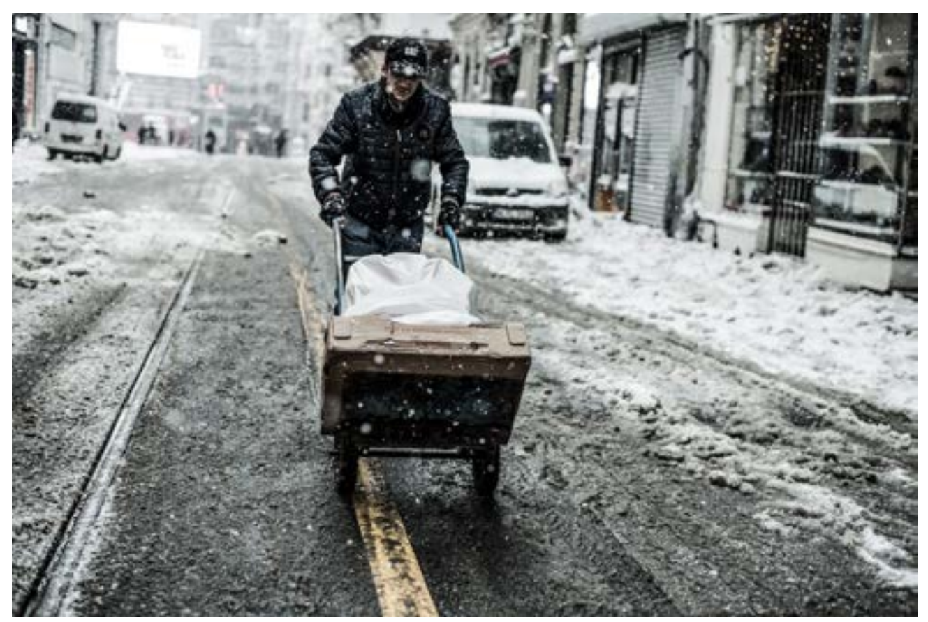
Syrian refugee working in Istanbul, Tukrkey. January 2017.

In comparison to the funds pledged and or committed to Turkey at the London Conference and through the EU-initiated Facility for Refugees in Turkey, Turkey has spent approximately $25bn of its own fiscal resources on the refugee response.42